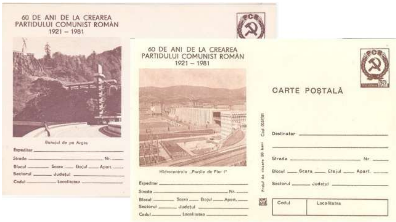
Figure 5. The Dam on the Argeș (1981) and “The Iron Gates I” Hydropower Plant (1981)

On the analysed postal cards, large projects of the communist period are illustrated. For example, The Iron Gate I Hydropower Plant, which was at the time of completion in 1972, one of the largest hydroelectric power stations in the world and remained the largest dam on the Danube River and one of the largest hydro power plants in Europe [34:89, 35]. Another hydroelectric monumental project was Vidraru Dam on the Argeș River, with its picturesque landscapes. At the inauguration, in 1966, the dam was on the sixth place in Europe and the seventh in the world by type and dimensions; in 2013, it remained on the 15 th place in Europe and 27 th in the world considering its height of 166.60 metres [36:12]. These megaprojects (Figure 5) were an element of national pride that the Party promoted boldly on every occasion and so these engineering monuments have remained tourist attractions and a legacy of the golden period of hydropower in Romania (1960-1980).