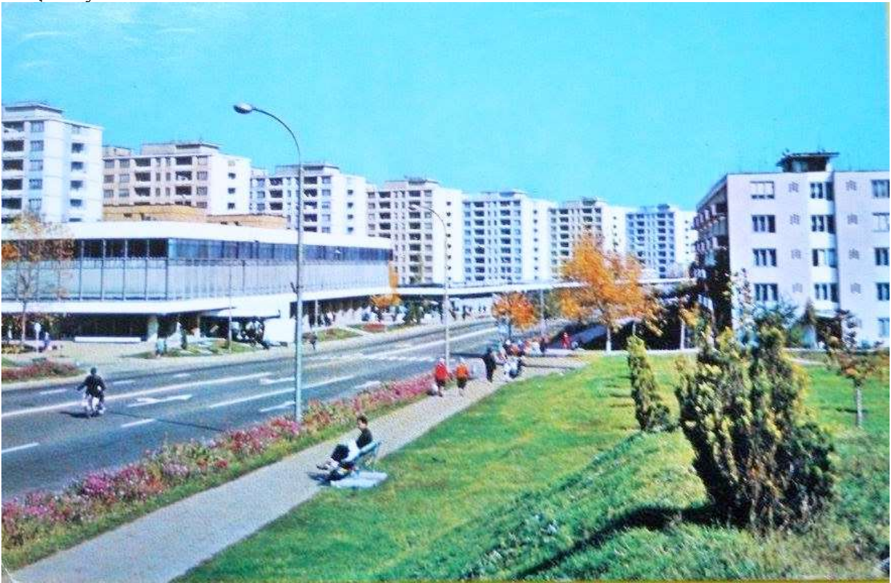
Figure 2. Oituz Boulevard in Onești (Gh. Gheorghiu-Dej) – Urban Landscape Characteristic of Many Systemised Towns and Cities of Romania

The typical cityscape was dominated by the blocks of flats districts according to the representations in picture postcards. These blocks of flats were also placed in the city centre, along new boulevards (e.g. in Târgoviște, Baia Mare – with George Coșbuc Street –, Onești (Figure 2), Tulcea, etc.). For Zlatna, in the 1970s and 1980s, new residential districts (blocks of flats) were represented. A picture postcard of Piatra Neamț includes a representation of an important ruler (the statue of Stephan the Great), and many representations of blocks of flats. The latter is true also for Pitești city.