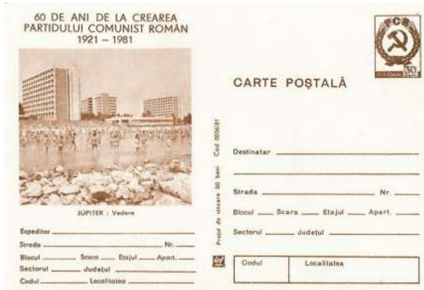
Figure 1. The Romanian Seaside at Jupiter, representation from 1981 propaganda postal cards series

area (e.g. residential districts or city centres).