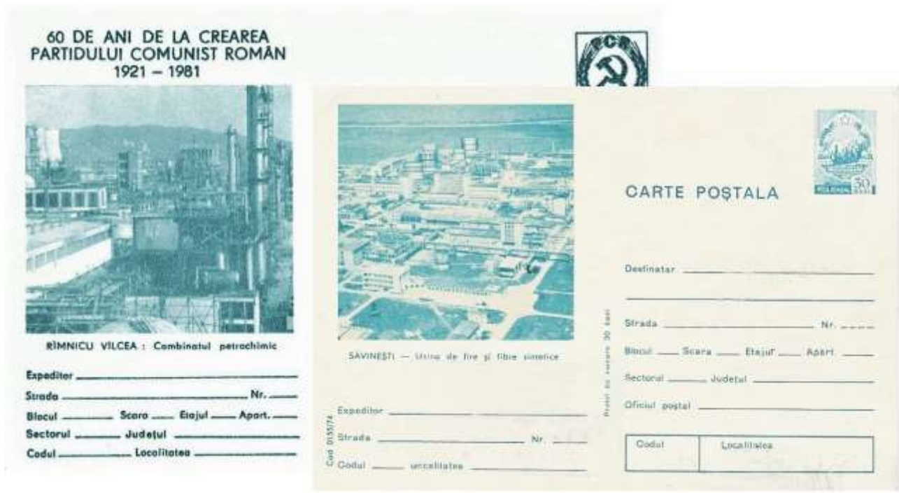
Figure 6. Râmnicu Vâlcea: The Petrochemical Factories (1981) and Săvinești: The Synthetical Threads and Fibres Factory (1974)

Large chemical factories such as those from Râmnicu Vâlcea or Săvinești (Figure 6), with more than 20,000 employees [37] have remained in the local memory and also as local identity icons, considering that these factories and their products were known nation widely. Ore smelters like that from Hunedoara (for decades it was the home of the most important iron and steel industry from Romania) [38, 39] were considered great achievements of the Communist Party.